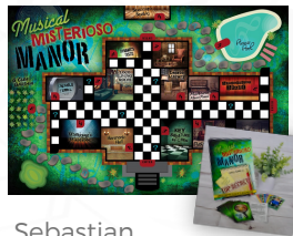
Sebastian Sharp & the Case of the Missing Manuscript