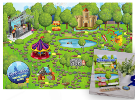
Manhattan Medallion Hunt