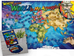
Where in the World is Mr. Arpeggio?