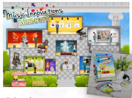
Music Innovations Museum