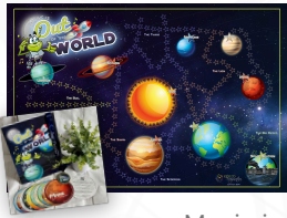
Music is Out of This World