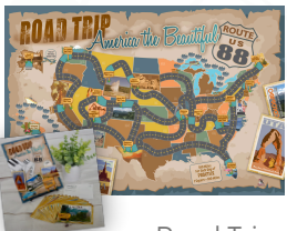
Road Trip: America the Beautiful