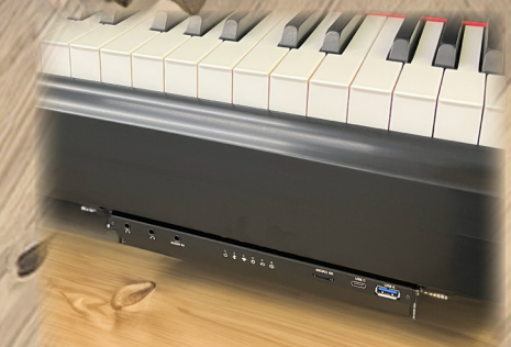
PNO4 Controller Slides Out Of Sight

*Manual and Automatic Slide mounts available