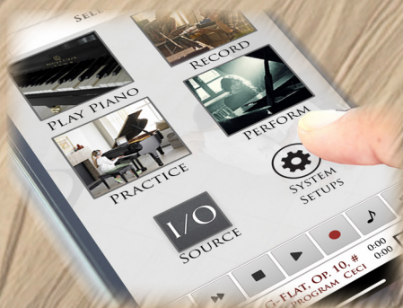
Access Via Web Enabled Device