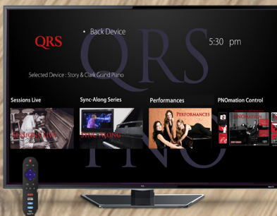
Access Via QRSTV Roku